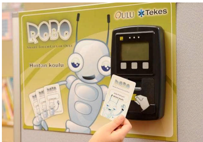
Figure 3. The visual outlook of the “Robo” card and the reader device.

Before the beginning of the field trial, one of the pupils in the special-needs class had invented the name “Robo” for the contactless smart card. His idea was used in designing the visual outlook of the card (see Figure 3). Receiving the card had been especially important for the boy who came up with the “Robo” name: the boy had been very pleased that his own idea had been implemented. According to the teacher, for the same boy the start of the school had been especially difficult and for him the opportunity to influence the smart card design had been a very important boost to his self-esteem. Even though the children’s role in designing the card was not very big, the other children clearly valued as well that one of them was behind the idea for the smart card name and appearance.