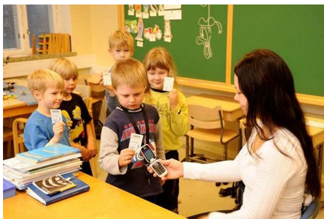
Figure 5. Pupils log in by touching the teacher's NFC-enabled mobile phone with their "Robo" cards.

The parents reported that the contactless smart cards and the attendance supervision concept had been received very well by the children. Parents said that their children felt the supervision was important and took a big responsibility for keeping the card safe and carrying it to school every day. One of the parents commented, "A proud and eager pupil has remembered it well." For example, one child had gotten really excited when he received the card that was similar to the card his father used at work. The parents said that the children had taken care that they always had their cards with them, and for some of them it seemed to be very important that they had their cards with them all the time. Figure 5 shows some pupils logging into school.