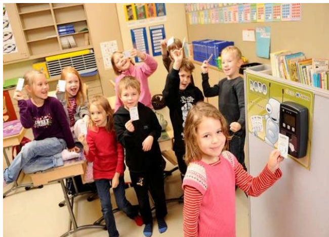
Figure 4. Pupils log into the school by touching the reader device with their contactless smart cards.

Using the system seemed to be easy according to the children: "You just put the card there like this," "You can put it either way," "You don't need to wave it, just flash it there quickly," "When it [the device] says OK, login has succeeded." In Figure 4 there are pupils logging into the school.