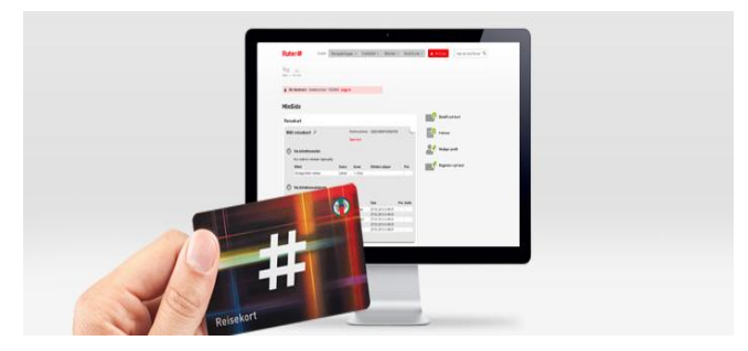
Figure 4. Accessing on the internet the information from the smart card.

Travelers can always buy more than one ticket. For example, a user of the 30-day ticket may buy a new 30-day ticket before the old one has expired. The smart card ticket can also contain several tickets of the same type, e.g., two 30-day tickets or several different types of tickets