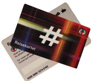
Figure 1. A smart card ticket used in public transportation in Norway.

In We don't want this! , the author compares the paper coupon card with the pay-as-you-go smart card. Since the author is a pensioner, she used to have a discount coupon card, recognizable by a different color than the regular coupon card. The card was unregistered and could be used by several people traveling together. The monetary value of the ticket was printed on the card and the empty spots on the card visualized how many trips could still be made with the card. Once the coupon card was stamped in a ticket machine on board the bus or tram, or on the platform of the train or metro, the validity of the ticket could be read on the timestamp.