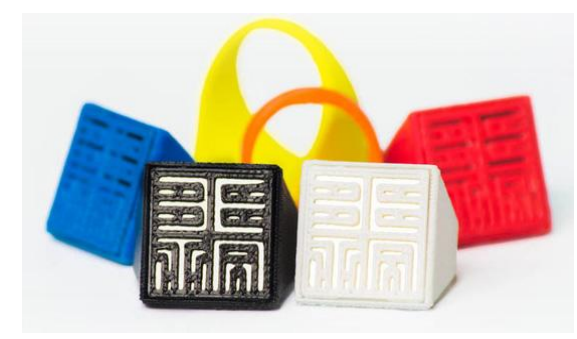
Figure 8. Wearable technology seems to be the direction for transportation solutions. Photo: Kickstarter, [27].

place it inside a ring, see Fig. 8. Rings are custom sized and users may create their own designs for the front of the ring.