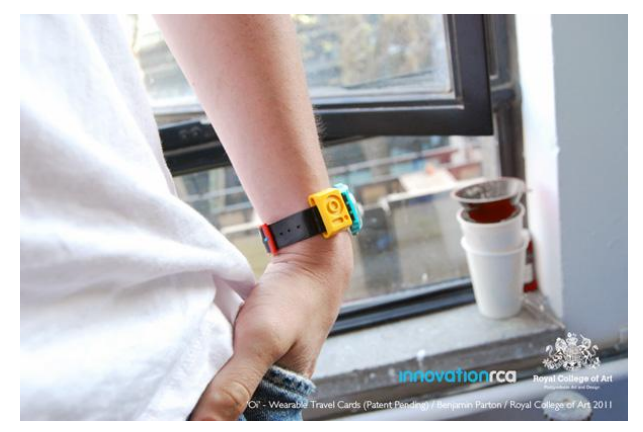
Figure 9. A wearable solution replacing the plastic smart card is proposed for London transport.

The MBTA and London transport services are possibly different than services offered in Oslo, but the wearable tickets offer one possibility to code type of the card: color. One could then instantly and easily identify those carrying monthly, weekly, daily or any other type of ticket offered by Ruter. However, the problems related to visibility of expiration time would still remain unsolved, assuming current rules and regulations around the use of the card.