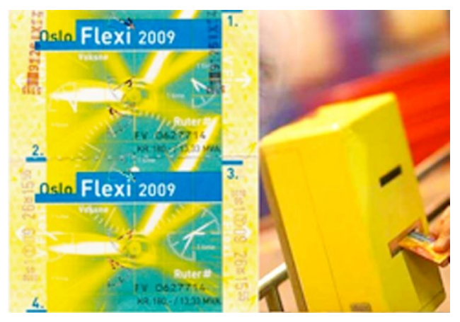
Figure 3. A paper ticket (left) and a ticket stamp machine (right).

The information provided when the ticket is purchased is at all times visible on the paper ticket in the form of printed text (type, value, duration), the size of the ticket (type), the color of the ticket (type), and the shape of the ticket (type). For example, the Flexicard, the 8-trip ticket (see Fig. 3), was the only folded paper ticket. It had a pre-printed text to indicate the value of the ticket (kr.180) and the word 'voksne' (adults) to indicate that it was a regular ticket. Also the color of the ticket informed the traveler that it was a regular ticket. Discount tickets have a different color. The printed text on a strip is a timestamp, indicating the time when the one-hour validity of the ticket ends. This timestamp is added to the ticket when a traveler enters a metro platform or a bus or tram and inserts the card in a ticket stamp machine (see Fig. 3).