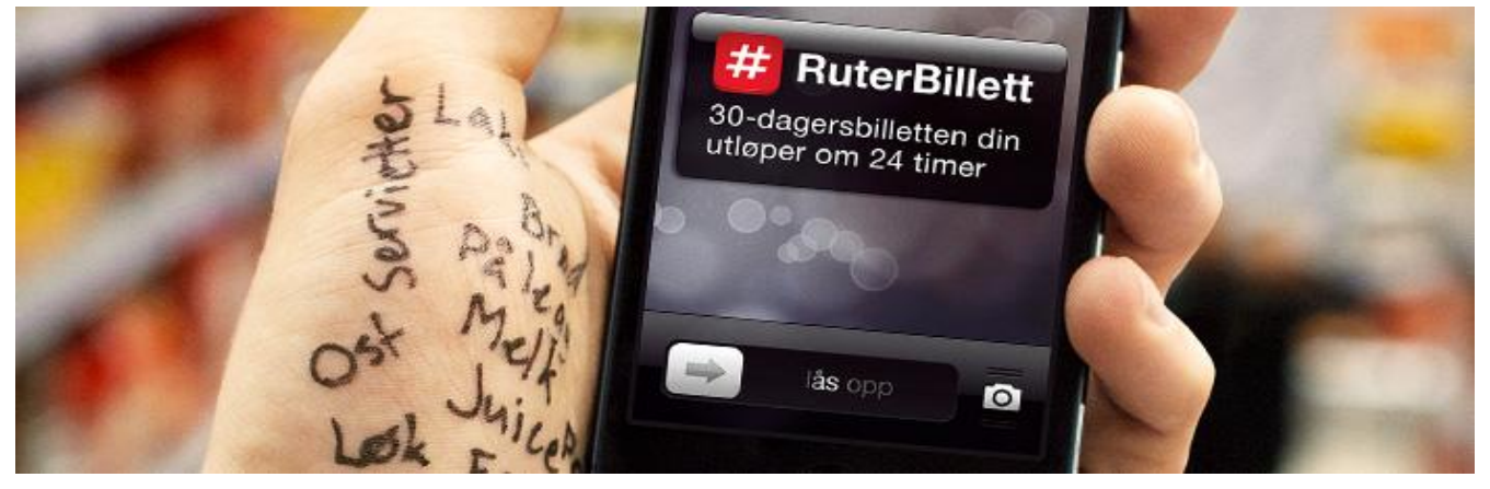
Figure 10. The new Ruter mobile app. One can clearly see the type of the ticket and the expiration date/time: 30-day ticket expires in 24 hours.