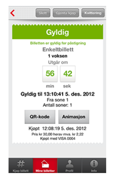
Figure 6. An adult single trip ticket: the green zone states: valid and the timer shows the exact amount of validity time left

None of the travelers, who were positive regarding the new smart card system, addressed the issue of ticket information visibility of the smart card ticket. They had found 'work arounds' for the loss of basic ticket information, e.g., setting an alarm on the mobile phone or validating the ticket every time they used public transportation, even if their ticket type did not require this. Many of the positive travelers are now using Ruter's mobile app, which was launched in December 2012. The app provides all basic ticket information, including a count down function for travelers who bought a single ticket with one-hour validity (see Fig. 6).