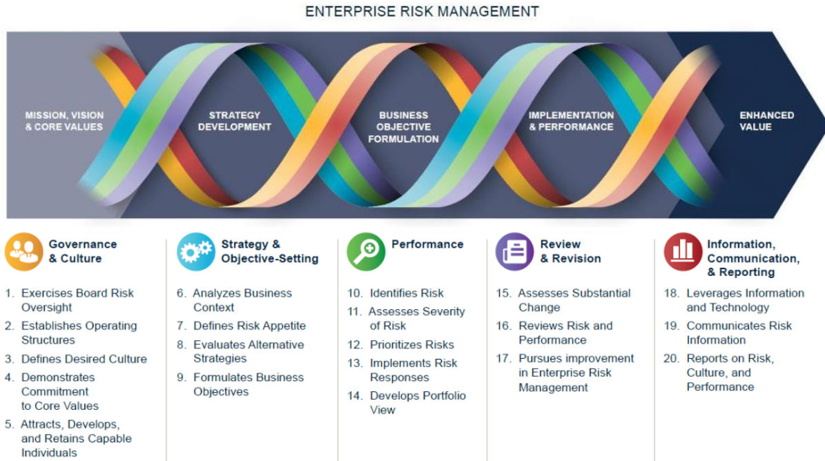
Figure 2. COSO ERM 2017 Risk Management Components and Principles [15, p. 21, Fig. 5.1 / pp. 22, Fig. 5.2]

ISO 31000, COBIT for Risk, and the relevant NIST special publications. The 20 principles provide a good set of key principles which management has to follow in order to establish mature risk management processes in the organization. COSO ERM 2017 discusses the problem of cascading risks, continuous changes of risks and the required adjustments of the risk profiles and established responses, and it covers cost implications.