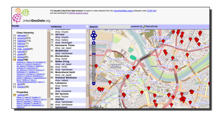
Figure 2. The LinkedGeoData browser Semantic Web Application.

properties. In order to encourage reuse of both properties and property values, the editor performs a type-ahead search for existing properties and property values and ranks them according to the usage frequency. When changes are made, these are stored locally and propagated to the main OSM database by using the OSM API.