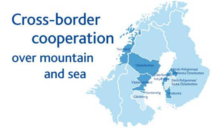
Figure 1. Interest area for the EU Botnia-Atlantica project [1].

The Swedish university of agricultural science (SLU) and Centria in Österbotten, Finland, have already done research related to farming. The purpose of this project is to conduct applied research in the area of ASN so as to strengthen the collaboration between these groups and establish a knowledge cluster in this field. Specifically, the project will develop systems to collect information about individual animals in large areas.