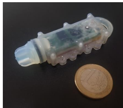
Figure 1. Seaweed attached sensor, AquaBit Unit

the motion of the attached sensor, we can estimate the strength of current or wave. Theoretically, acceleration is the second time-derivative of position, and vice versa, position is the second integral of acceleration. Therefore, we should be able to calculate the position of AquaBit easily from the accelerations measured by the IMU. However, this calculation results in huge position error as the consequence of measurement noise.