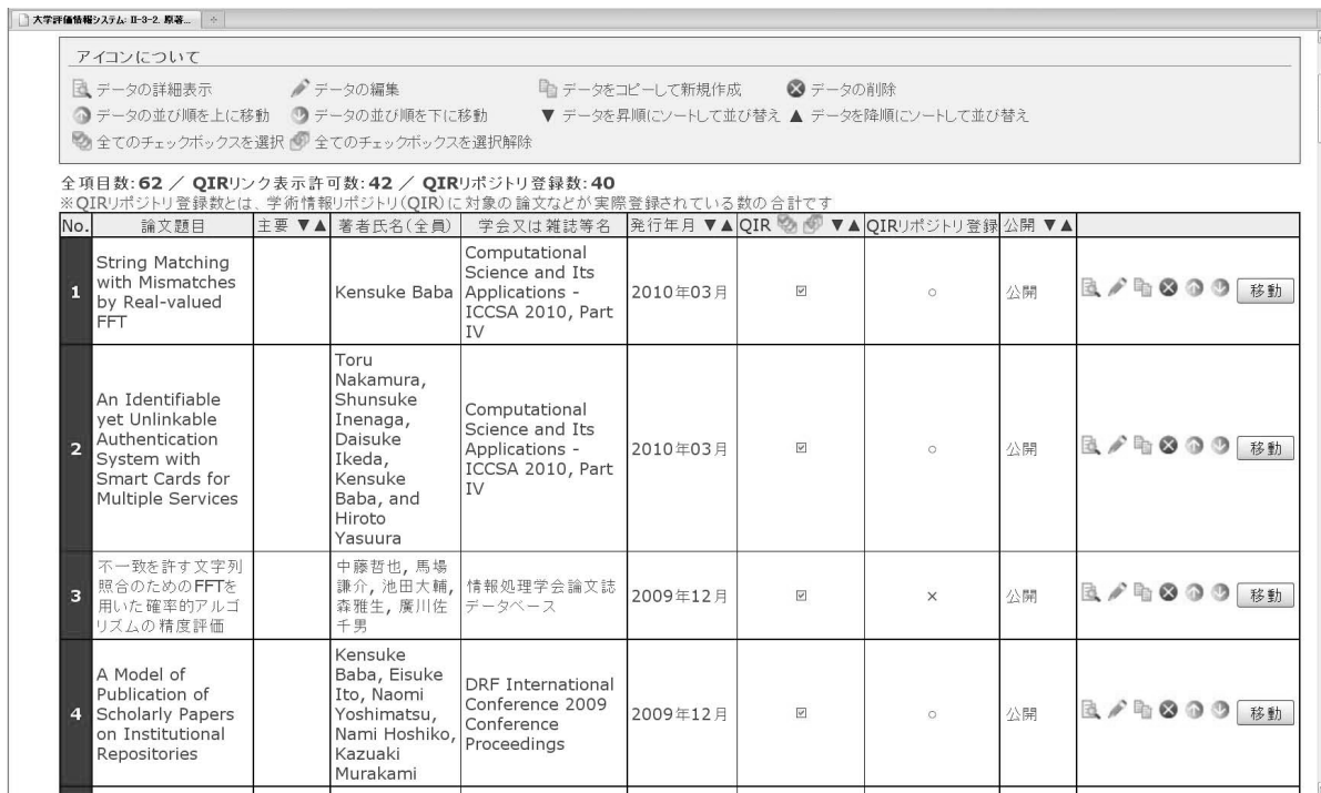
Figure 3. The data-entry system of DHJS connected with QIR. This example is the interface for registration of (the metadata of) scholarly papers for the user “Kensuke Baba”.

the registration form of QIR. The interface will be improved by Nov, 2010 so that users can upload a full-text of their paper directly in DHJS.