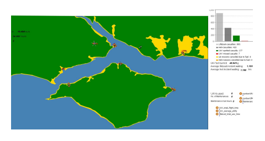
Fig. 2. The simulation animation

is used to calculate a value for the product design in order to optimize it.