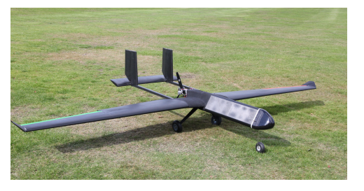
Fig. 1. The DECODE-UAV

In the context of this research, an operational simulation is defined as a non-analytical model recreating anticipated operations of a product during its service life. The model does not recreate existing missions. Instead, the aim is to embed the product into its future operational environment. Therefore, real-time data management and decision making are not aspects of the operational simulation presented here.