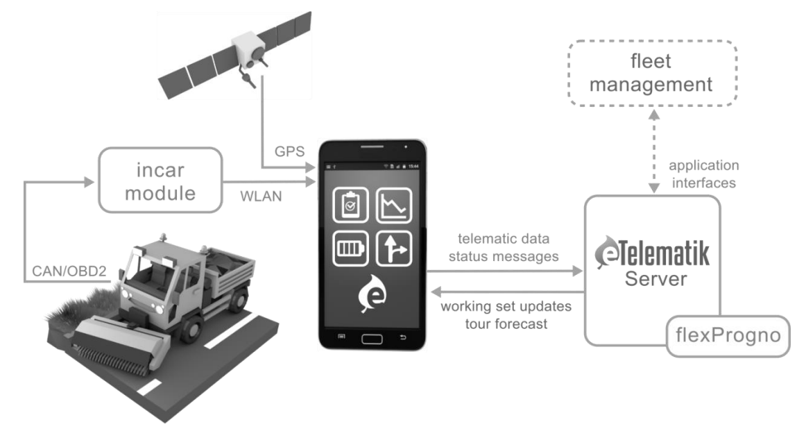
Figure 1. eTelematik system architectur overview (adapted figure, based on original by Johannes Kretzschmar, University Jena)

SMART 2015 : The Fourth International Conference on Smart Systems, Devices and Technologies