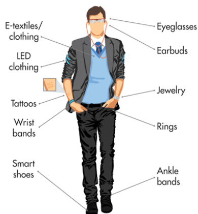
Figure 3. Body wearable networks.

There is a large variety of wearable devices and Apps, from fitness bands (which are essentially data collectors) to portable heads-up display; additionally, complex interactions occur between the touch display, cameras, and fast data communication with mobile platforms (see Figure 3).