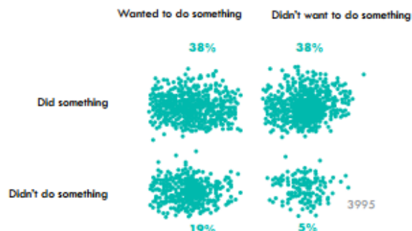
Figure 3. Pilot study conducted in 2015 in Rwanda by GirlHub.

share a true story about an experience in a girl’s life. They were then asked whether, in their story, the girl wanted to do something, did not want to do something [mapped across the horizontal axis] did something, or did not do something [mapped on the vertical axis]. The researchers then focused their interest upon those stories where ‘wanted to do something’ met ‘did something’, to discern patterns that could lead to recommendations for future empowerment. For instance, they noted that, “The areas where girls and parents were viewed as having the most decision-making ability were education and health”.