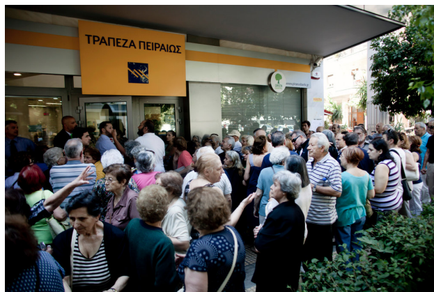
Figure 2.

If Figure 1 shows a clear example of (ab)use of heritage to (emotionally) convey political statements, otherwise based on assumptions, Figure 2 shows the retired Greeks waiting to receive partial pension payments outside of a bank in Athens, who can hardly get relief by that “history of defiance” founded in Greek history, as described by Nick Malkoutzis. Our vision is that multi-user sharing platform can start to make the difference today in a strong collaboration between computer science, humanities, and news broadcasting tools (e.g., Apple News as firstly realised with iOS 9 in September 2015 [30], and Facebook Instant Articles [31]).