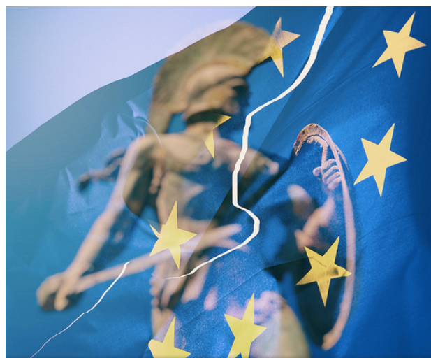
Figure 1. Greek “No” to the Troika and king Leonidas’ legacy [29].

website [27], in saying: “It is true that deep in the Greek psyche is the idea of glorious resistance against all odds. Moments of defiance, he added, are “written into the conscience of every Greek”. Instances used to justify this understanding of the Greek psyche are handpicked from both history and mythology, from legends of women throwing themselves off cliffs to escape slavery, to the iconic figure of the Spartan king Leonidas remembered for his death at the Thermopylae, to Greek fighters blowing themselves to avoid being captured by the Ottomans in the 1800s [28].