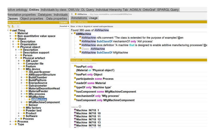
Figure 2. AMMachine Class in AMO ontology

Figure 2 illustrates the AMMACHINE concept and its properties in our AM ontology created with Protégé [13].